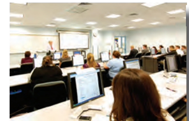
Computer Class Room