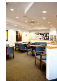
Lobby and Sitting Area