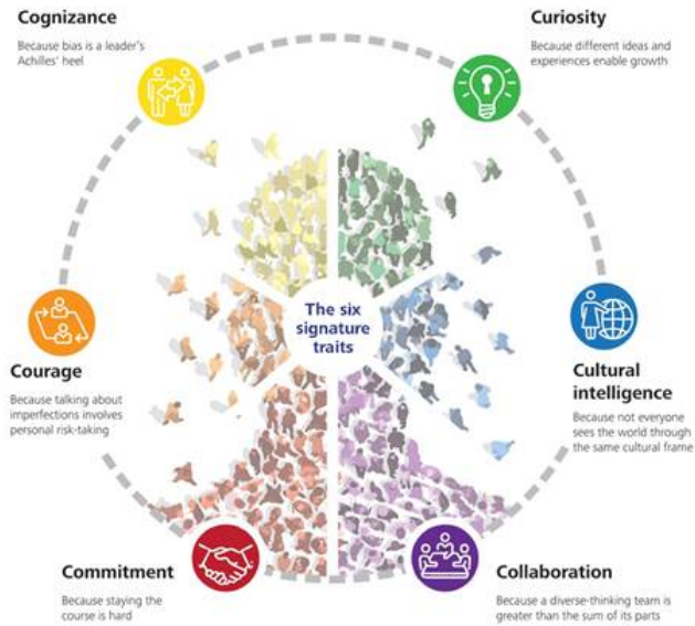
Figure 1. The six signature traits of an inclusive leader

Graphic: Deloitte University Press | DUPress.com